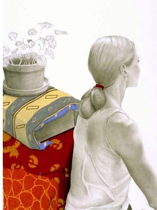
Gail Postal Dry Media