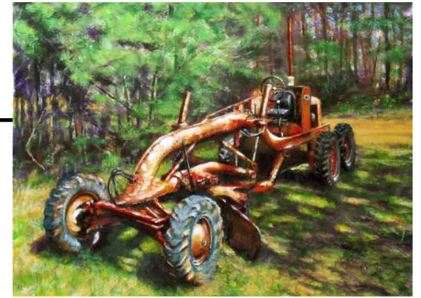
Donald Housler Acrylic painting

Prizes will be awarded in 2-D and 3-D categories. Cash awards up to $2000.